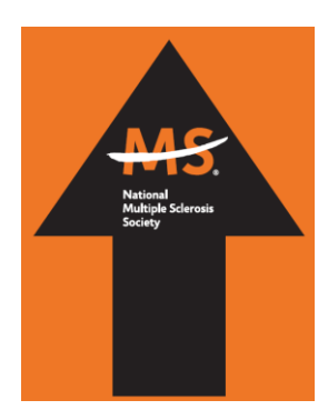
75-mile route: Orange arrows both days