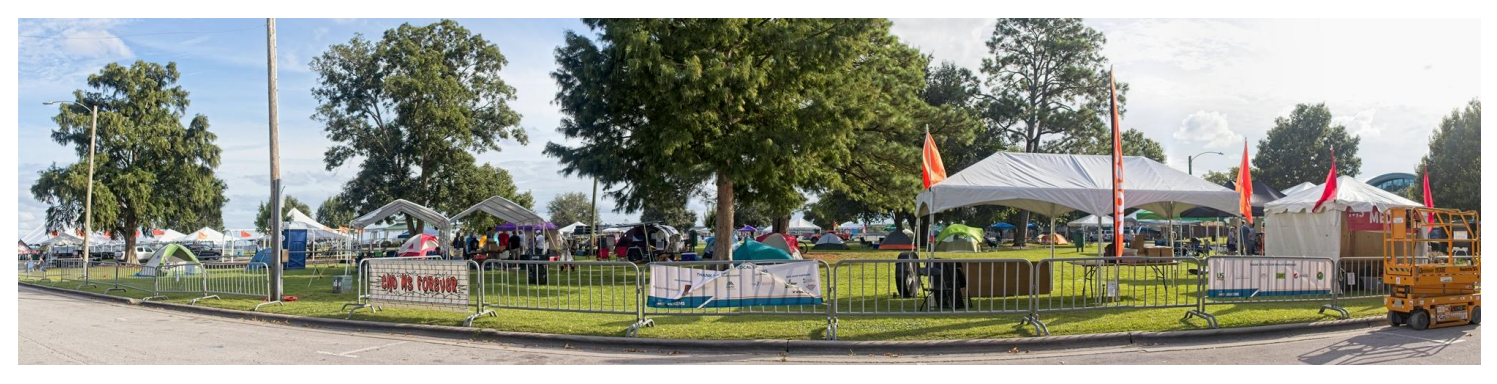
TEAM TENT SET UP TIMES Friday, September 8<sup>th</sup> 3 PM – 8 PM

We know it takes many people to pull this ride together. From the volunteers that assist you, to the donors who write the checks, to the family members who support your training and fundraising, to those with MS who motivate and inspire... so many individuals working together toward a world free of MS. And what better way to celebrate your team's accomplishment than to gather these individuals under one tent at the ride to toast your team's victory! This is what the Team Village is all about. Union Point Park, the home of Team Village, is the center point of the Bike MS activities and a gathering place for teams and team members. Teams can check into team village starting Friday afternoon. Each team that participates can reserve their own space to eat, drink, prep for the ride, and relax with friends on the beautiful waterfront of New Bern.