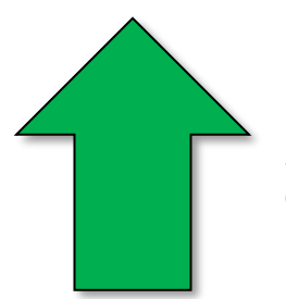
30-mile route: Green arrows both days

Cue sheets will be available at packet pick up inside the convention center. It is a source of information concerning mileage, rest stops, and other areas of interest. The GPS files are also available on our website via Ride with GPS.