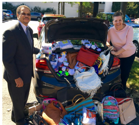
SOCAP's gift of socks and purses

Thanks to donors like you, we were able to deliver an assortment of much-needed products to hundreds of men, women, and children struggling with homelessness. Together, we collected 1,094 winter accessories, 760 personal care kits, 1,911 various personal care items, 400 feminine hygiene kits, and more. To show our appreciation, here is a list to all of those who gave in 2016.